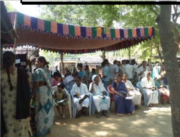
← EYE CHECK UP CAMP AT SITTLINGI- TRIBAL VILLAGE NEAR DHARMAPURI - . PATIENTS WAITING