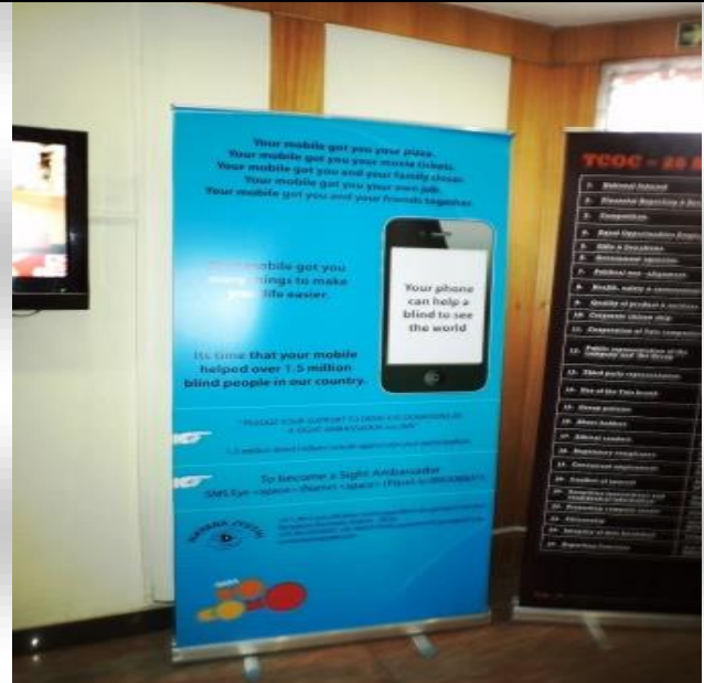
TATA DOCOMO SPONSORED STANDEES →